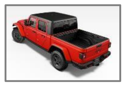
Freedom Black Hard Top

The 3-piece hard top is available in black or in body colour. Easy to remove, it is also fitted with a manual, sliding back.