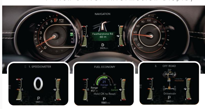
7-inch Driver Information Display

Front and centre in the gauge cluster, you'll find a wealth of scrollable vehicle data in full colour that you safely control via steering-wheel buttons.