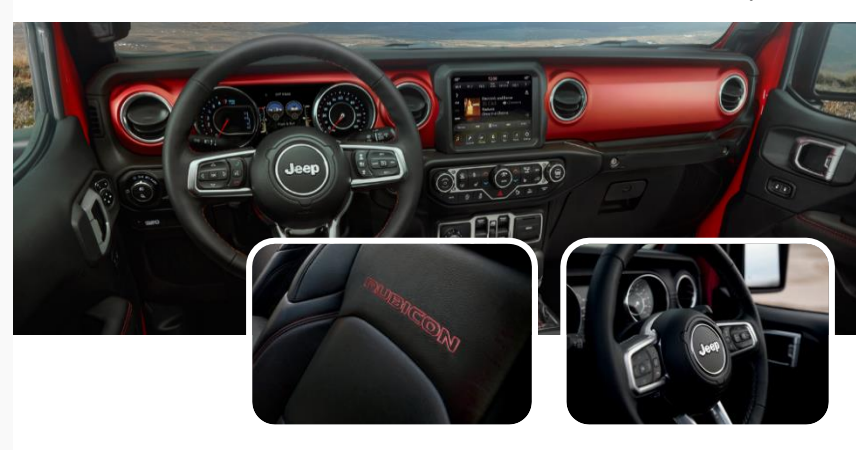
Jeep® Gladiator is crafted with premium materials and more attention to detail, so you can pay attention to the road ahead in comfort. This is style that steps it up to perform extra duty, for both business and pleasure.