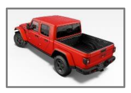
Freedom Hard Top in body colour

The 3-piece hard top is available in black or in body colour. Easy to remove, it is also fitted with a manual, sliding back.